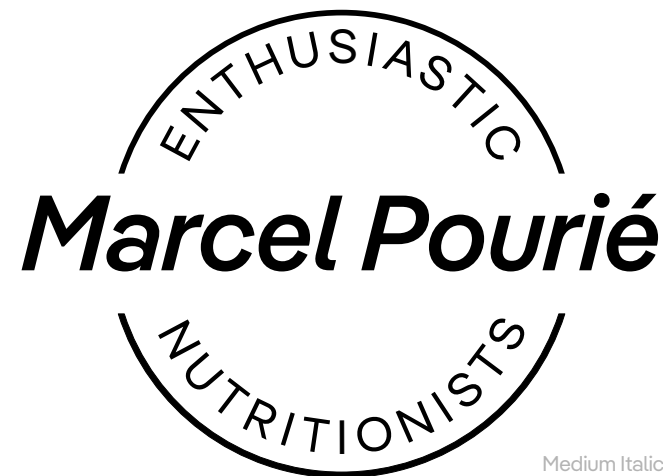
Medium Italic 40 pt, Regular All Caps 18 pt

CALLAS [REDACTED] [REDACTED] IN CONCERT [REDACTED]