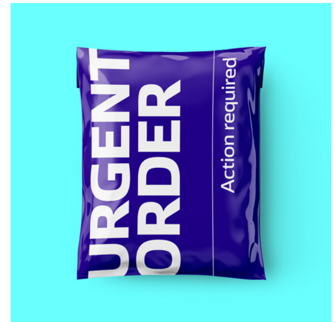
Fictitious use-case designed by Felix Braden

The very open forms of this Neo-Grotesque achieve a significantly higher legibility and elegance compared to older typefaces of this type. Turbine's preferred partners are slab serifs, especially Clarendon-like ones such as Bookman, Sentinel or Pulpo. But also narrow-running sans-serifs like Ika Compact are a suitable counterpart to our technical-looking Turbine.